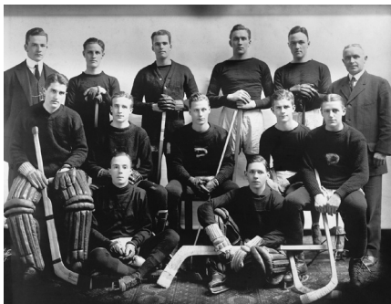
HOBEY BAKER AND HIS PRINCETON TEAM