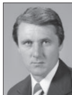
1970s Herb Brooks Minnesota