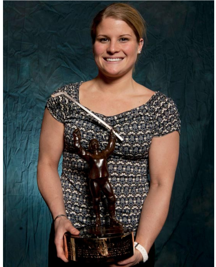
Wisconsin Forward and Preseason WCHA Player of the Year Brianna Decker was the 2012 Patty Kazmaier Memorial Award Winner as Well as the WCHA Player of the Year

The complete 2012-13 composite schedule is at the back of this release.