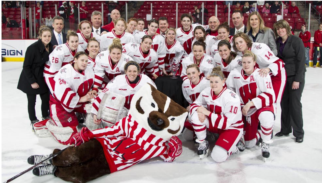
Wisconsin Badgers • 2011-12 WCHA Champions